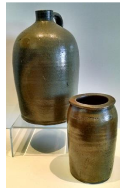
Stoneware from “Kentucky Clay”

This exhibit showcases and explains how the wealth of clay deposits all across Kentucky gave rise to an abundance of potters, ceramic industries and clay traditions. Beginning with the origins of clay and early objects made from clay, the exhibit shows the development of tools and processes used in ceramics. Through text, photos and objects, the scope of Kentucky ceramics is covered from early Native American pottery shards to today’s contemporary ceramic works.